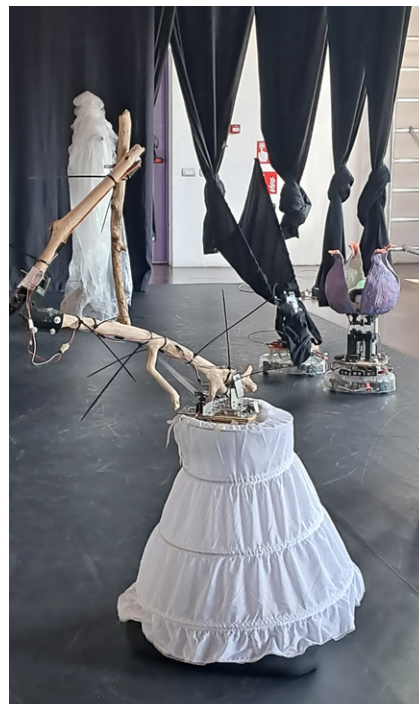
Fig. 5 The Robot Sonoma . In the foreground, in the company of the other robots.

Sonoma (Fig. 5) is a robot with 6 degrees of freedom (DoFs), 3 DoFs on omni-wheels and a 3-DoF arm that resembles a sickle, beak, or claw. It features a large gown on its lower body, which accentuates its rototranslational movement and responds dynamically to it. Sonoma stands at a total height of 120cm, making it the second tallest robot. Its arm can extend outward by over 1.5 meters, allowing for highly noticeable and unexpected expressive behaviours. Sonoma combines a human-recalling element, the gown, with an abstract wooden arm, creating a disruptive blend that encourages exploration and expression.