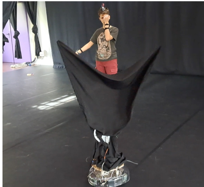
Fig. 3 The robot Blackwing . Controlled by a participant with sound and motion of the head and wrist.

Blackwing (Fig. 3) is equipped with omni wheels for rototranslation (3 DoFs) and a servo motor that controls two long thin poles, extending or contracting elastic fabric between them to create wing-like movements. An additional servo enhances the expressivity of the fabric by adjusting the frontal movement of the pelvis, effectively turning it into a sail, totaling 5 DoFs. Its aesthetic is characterized by black fabric covering its body, lacking an explicit face, thus maintaining a neutral appearance that directs focus towards its movement.