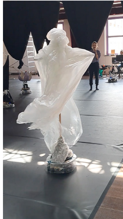
Fig. 4 The robot Scarecrow . Controlled by a participant with sound.