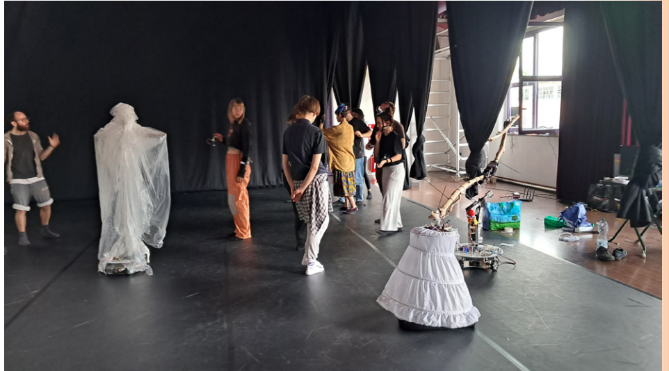
Fig. 7 First contact with technology. Hands on introduction to the control devices, app functioning, and robot motions.