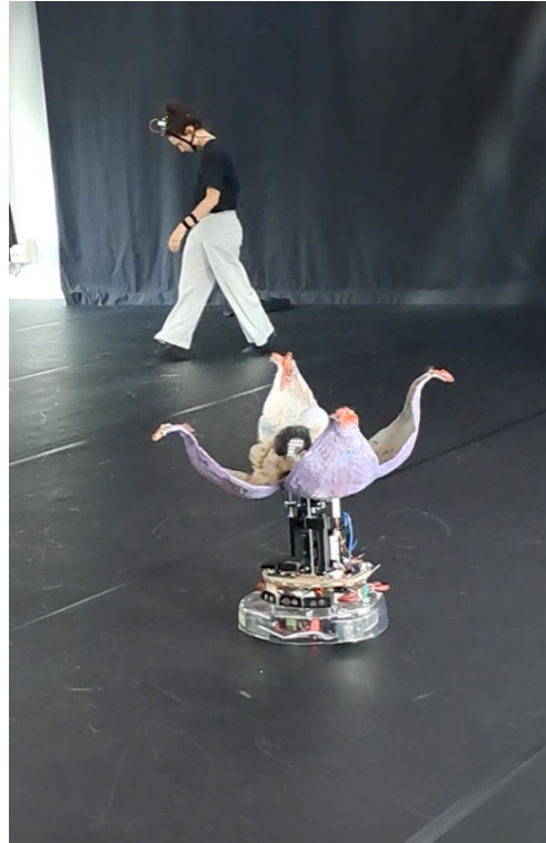
Fig. 1 The robot Siid . Controlled by a participant with motion of the wrist and head.