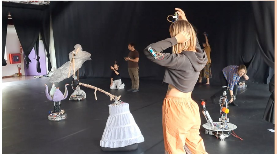
Fig. 8 Free experimentation: autonomously exploring the possibilities of the robots' and one's own bodies.

and encouraging changes when participants remained stuck on specific configurations. The goal was to ensure that by the end of this phase, all participants had experimented with all robots and devices at least once.