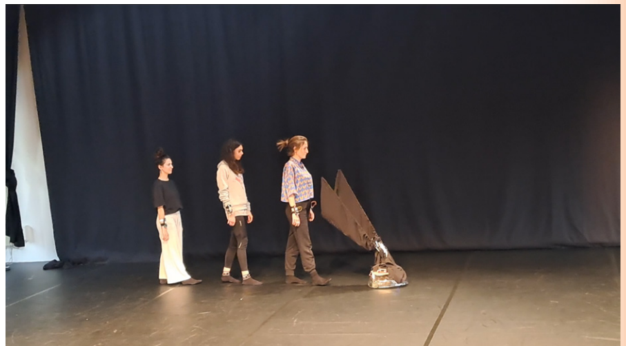
Fig. 9 Final scene: "In Sync". Collaboratively controlling Blackwing with motion .

Participants transitioned from guided (Section 4.5) through autonomous exploration (Section 4.7) into the final stage. They were tasked with creating their own performance using the devices and robots in any way they preferred. Participants gathered in a circle, and the papers they had written or drawn earlier (Section 4.2) were collected, grouped by theme, and placed on the floor. After reading them, participants stood next to the group that resonated with them the most, forming two groups. Each group was then given 40 minutes to create a scene, lasting no more than 3 minutes each, using the chosen papers as title and themes. Participants could incorporate music, and facilitators supported them throughout the creative process. Finally, both groups presented their scenes to the others (Fig. 9; Fig. 10).